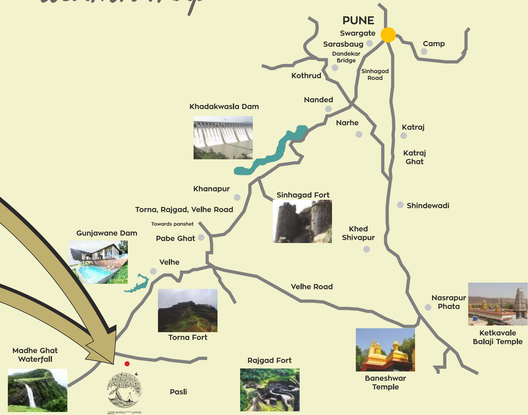
Map indicative only. Not to scale