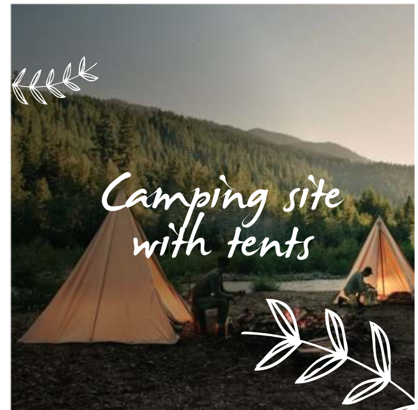
Camping site with tents