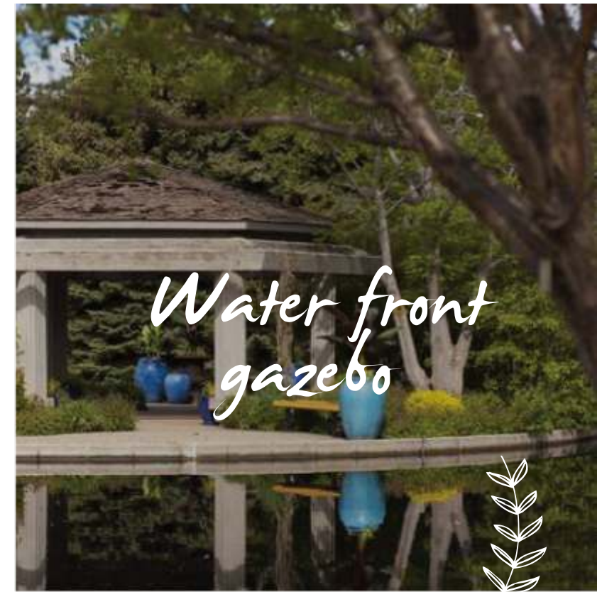
Water front gazebo