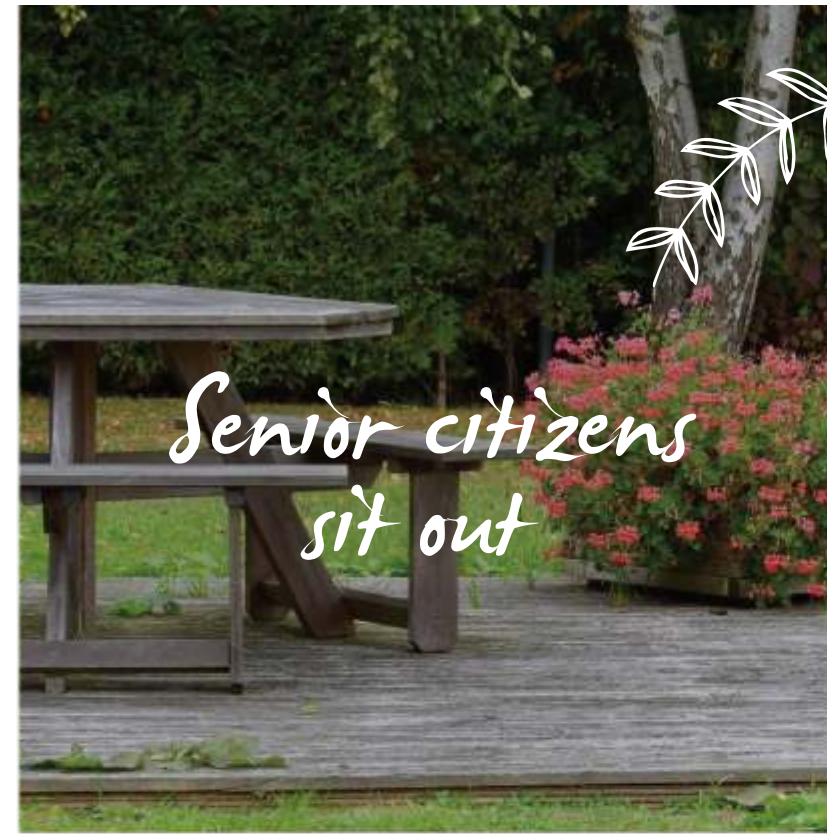
Senior citizens sit out